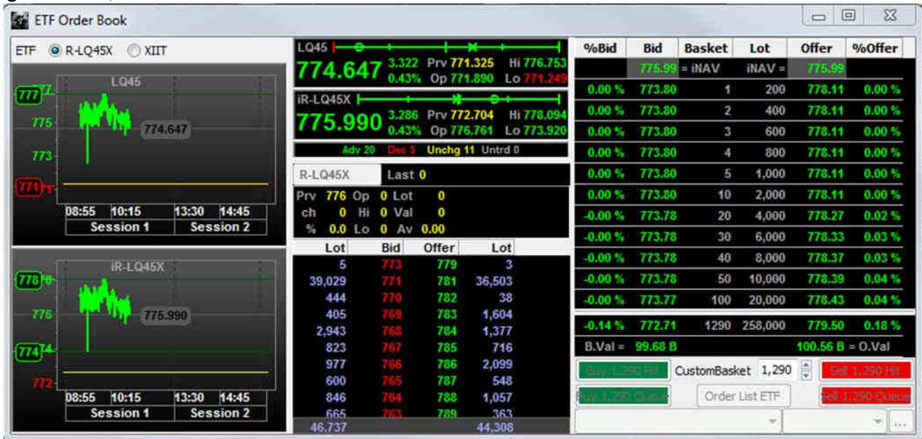
Figure 1. R-LQ45X Screen